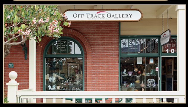
—Talented Local Artists Working Together—

The Off Track Gallery is owned and operated by the San Dieguito Art Guild (SDAG), a non-profit 501(c)3 (Tax Id # 95-3169585) organization made up of over 200 local artists. An elected SDAG Board of Directors meets once a month to set policy and resolve issues. All members pay an annual membership fee (see website for application), due on September 1 of each year. Members are expected to participate in the functioning of the guild — an organization made up entirely of volunteers.